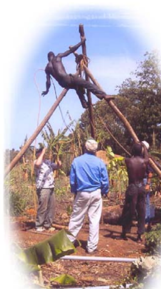
Drilling with a percussion rig

Encounter Uganda's objective is to teach people that clean drinking water is essential to life, health and prosperity and that the way to provide it is to fix their existing wells, drill new wells and to treat their water in a very simple, inexpensive and non-burdensome way.