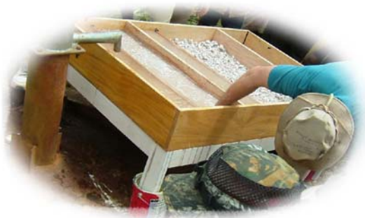
Installing a lime tray

The pumps and pipes rust after just a short time! This is another effect of the water being acidic. Encounter Uganda has researched pump and pipe materials and is replacing metal pipes and pumps with imported urethane pumps and locally obtained pvc pipes that will not corrode and will last many years without maintenance.